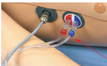
ILLUSTRATION OF INTERNAL PARTS AND THE OPTIONAL CONSOLE BOX CONNECTIONS