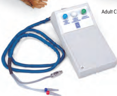
Adult CPR Full Body Manikin with Options

The purpose of this manual is to familiarize the user with the function, care and maintenance of Simulaids' Adult CPR Full Body manikin.