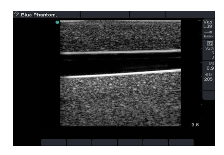
2. Non-imaging; the visible presence of air.