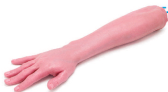
HOP-1 Surgical unit Code 2977