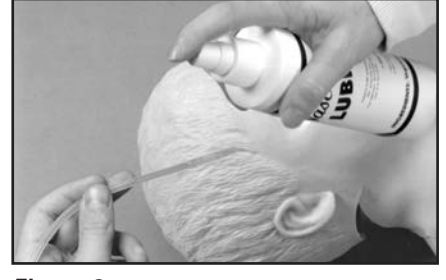
Figure 1 Lubrication